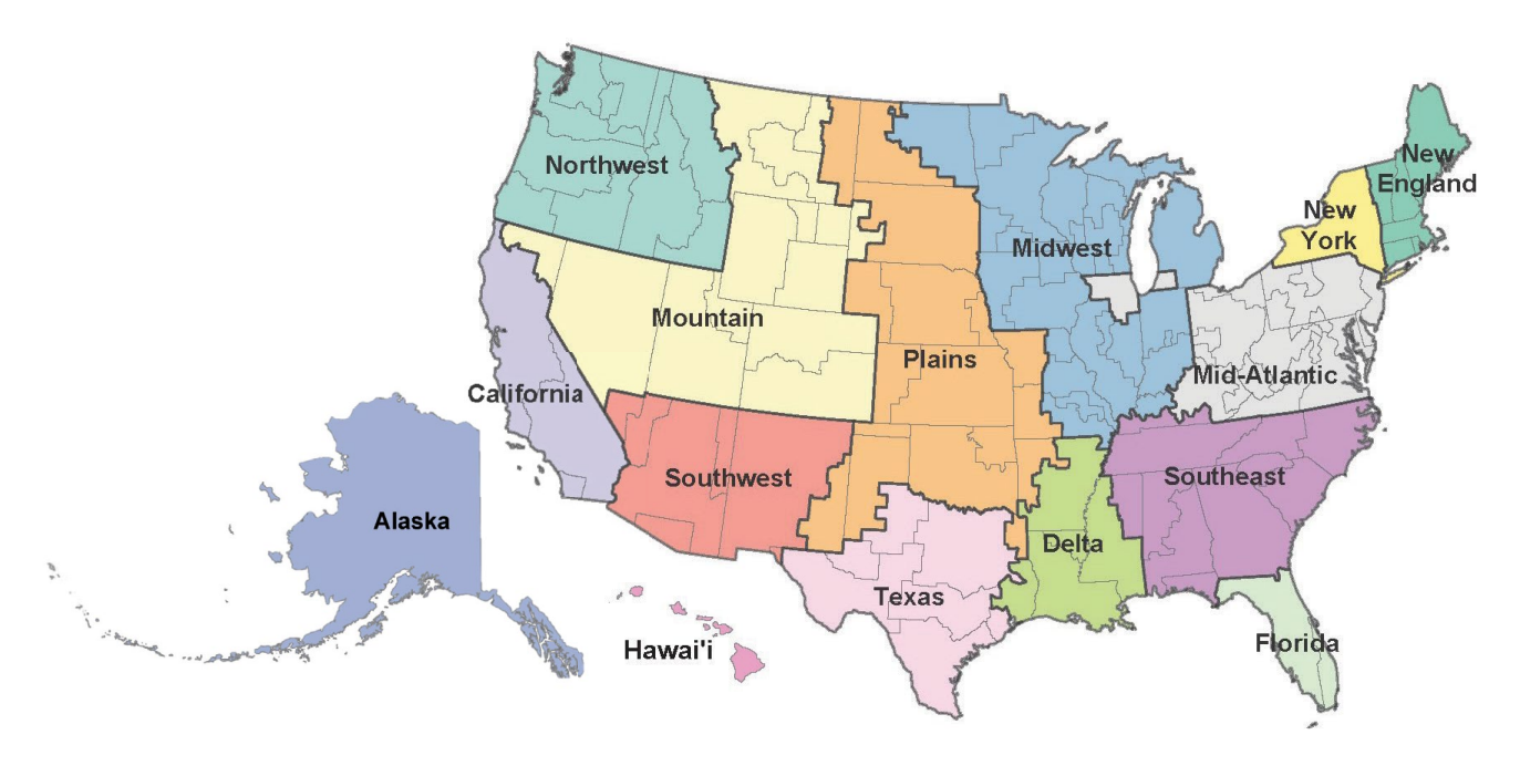
Figure 2 - DOE National Transmission Needs Study Regions<sup>8</sup>