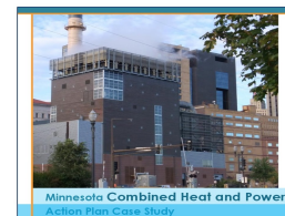
Minnesota Combined Heat and Power Action Plan Case Study

On May 20, 2016, NASEO hosted a webinar which provided an overview of the Minnesota CHP Action Plan that was developed through a strategic stakeholder process managed by Commerce. In addition, NASEO recently released a case study on Minnesota's experience, which provides recommendations to other states engaging in CHP or other energy action plans.